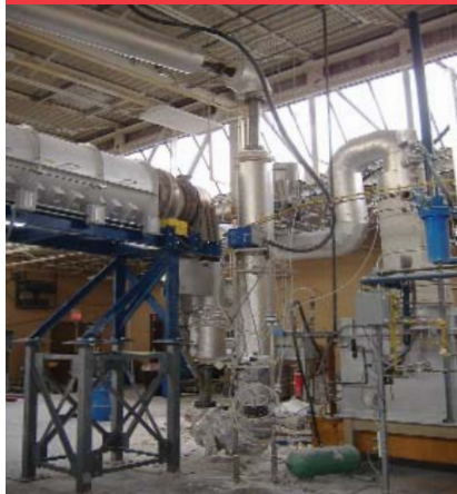
Snapshot of the sub-pilot scale facility of the CCR process integrated with a coal fired combustor.